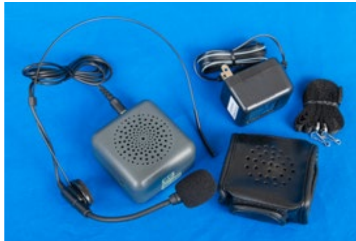
REF SP01 Spokeman Voice Amplifier

Carry case and strap allows you to carry it over your shoulder, fasten it around your waist or Velcro® it around your belt. Or take the Spokeman out of the case and set it on a table, desk or night stand. Has an on/off/volume knob. Runs on rechargeable AAA batteries, the Spokeman can also use 6 standard AAA alkaline, non-rechargeable batteries if you prefer. It even has a jack to amplify CD players, small radios, or communication boards.