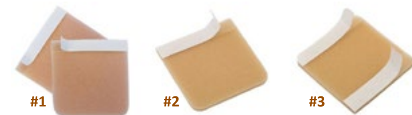
all foam varies somewhat in color from piece to piece