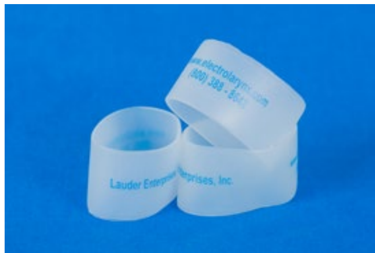
REF LAU01 Lauder Elastiband