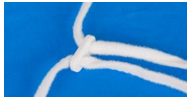
New adjustable Easy-Tie strap fitting