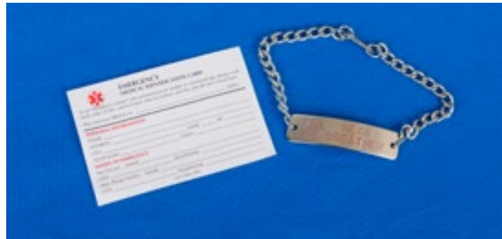
REF ID01 Medical ID Bracelet